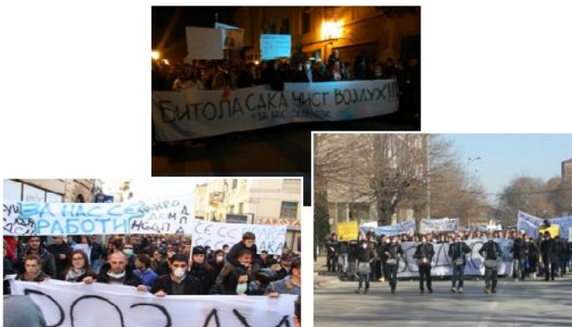
Figure 4. The atmosphere of the public protests

The paroles of the protests were deeply significant: "We want to breed", "Take off the gas-masks", "Air is a life, air is a right", "Bitola on gills" (Fig. 4). Several demands had been delivered from NGO "It's all about us" to local authorities: urgent placement of monitoring system in central area of the town; air pollution reduction and system of penalties for biggest air polluters; maintenance of air quality according to permissible limits.