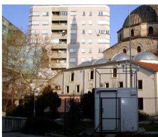
Figure 2. Monitoring station Bitola 2

The usual obstacles for systematic monitoring of the pollutants, especially of the particles (PM 10 и PM 2,5 ), and for the network creation are working/maintenance cost and cost for repair of the instruments, as well as the shortage of qualified personnel.