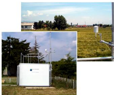
Figure 1. Monitoring station Bitola 1 Source: [6]

Bitola is such a town without monitoring network. There are only two monitoring stations: Bitola 1 is located in the town's periphery, at 13 km distance from the previously mentioned plant; Bitola 2 is in the town's centre, in public organization's courtyard. Bitola 2 is very often out of order. Both stations measure: O 3 , NO 2 , SO 2 , CO и PM 10 . The stations aren't mutually connected. Results from Bitola 1 are used in the reports of Ministry of environment, health organizations, NGO and others.