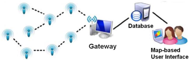
Front-end: geo-sensor network (monitoring area) Figure 3. Monitoring network in function Source: [7]

Back-end: monitoring and control platform